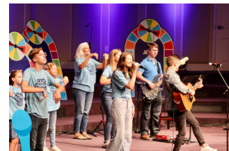
Students help lead songs at Belle Aire