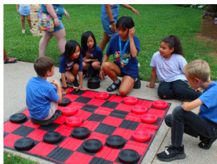
Children participate in recreation at Southeast

If you haven't reported your VBS numbers to the TBMB, please do at this link: www.vbs.lifeway.com/churchreports