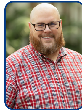
Dwayne Ewers Bradley's Creek Baptist Church Lascassas