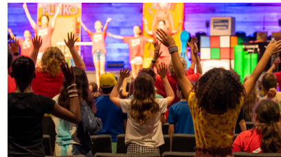
Children worship at Northside